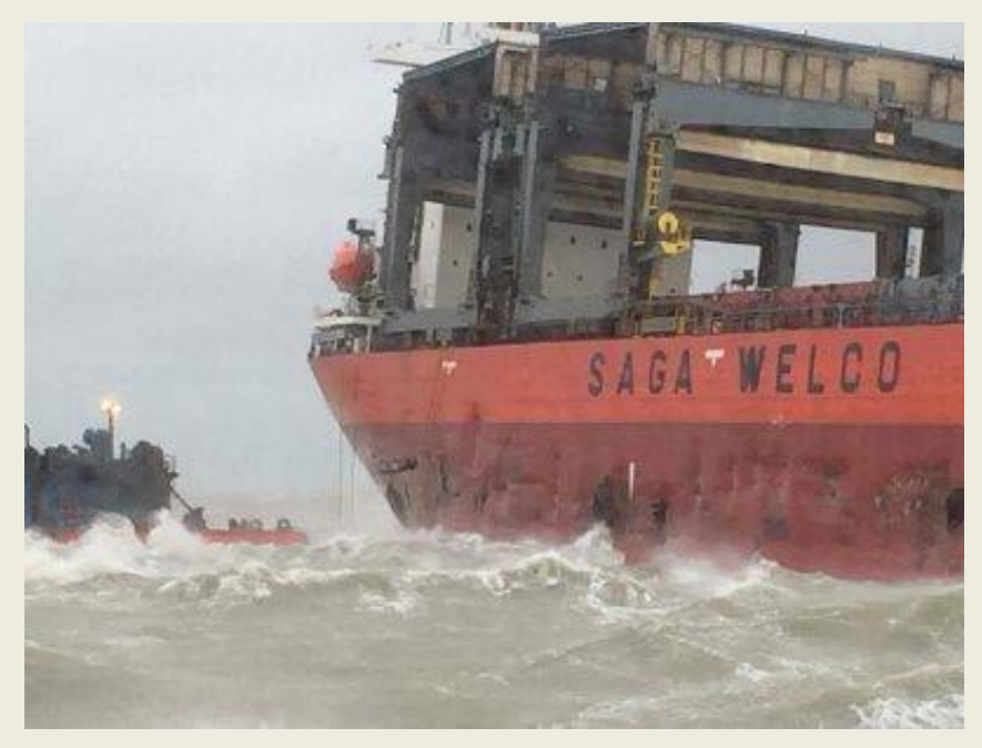
200 meters long.

vessel was reported to be fully operational and there have been reports of pollution or injury to crew. "Managers would like to thank the Coast Guard (MCA) for their highly professional response to this incident, particularly the difficult evacuation of nonessential sea-staff at the height of the storm," the statement said. The 47,000 dwt Saga Sky is operated by "open hatch" bulk specialist Saga Welco of Norway. The ship was built in 1996 and is