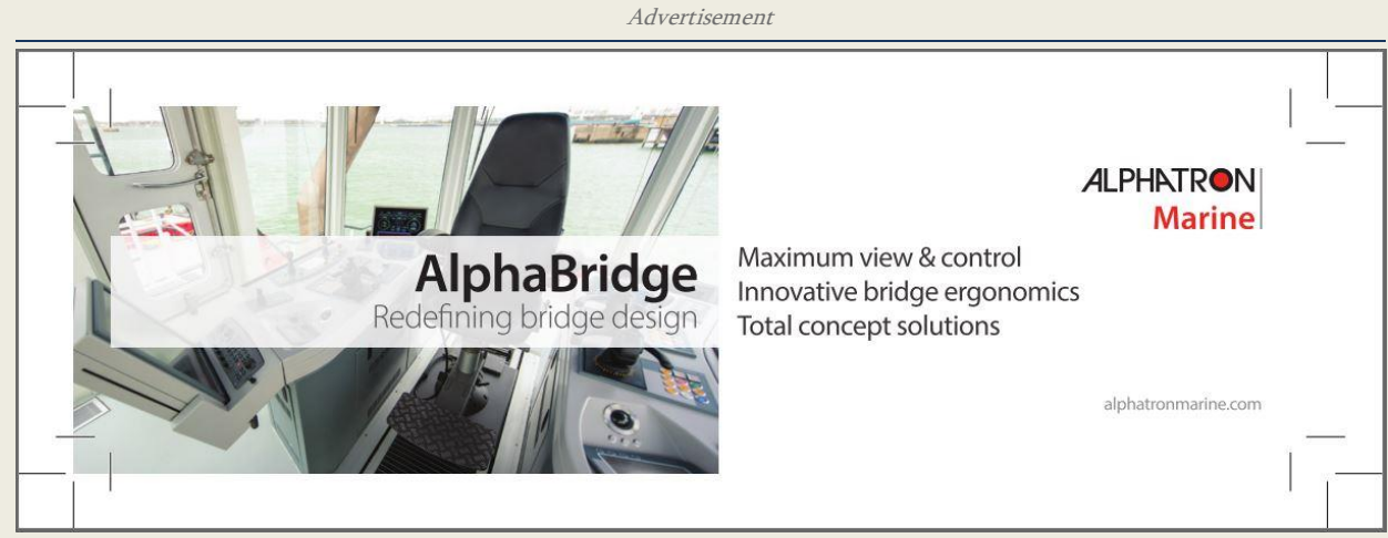
View the youtube film of the Alphabridge for tugboats on http://www.youtube.com/watch?v=hQi6hFDcHW4&feature=plcp

vessel in one piece, refloating the ship in two parts, dismantling the ship in place, or simply leaving the ship in place for it to be slowly eroded by the sea. After reviewing all options, the agency decided that the first option is to dismantle the ship in place. The 223-meter, Mexican-flagged Los Llanitos has beens stranded along the rocky Pacific coastline near Barra de Navidad, Jalisco since October 23rd when it ran aground after attempting to ride out powerful Hurricane Patricia. The first phase of salvage was completed in November, focussing on the removal of approximately 11,484 liters of oil, 489 cubic meters of diesel and other contaminants aboard the ship. Officials initially determined that the vessel was beyond saving, and would need to be cleaned and scuttled in the area. The approval needed to dismantle the vessel in place will be decided by Mexico's Secretariat of Environment and Natural Resources (SEMARNAT) after it is determined that the new plan will not cause any harm to the environment. (Source: gCaptain)