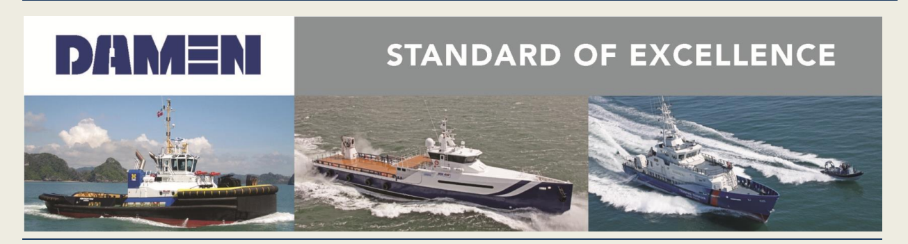
TIDAL TRANSIT ENTERS CHARTER CONTRACT FOR 'TIA ELIZABETH'