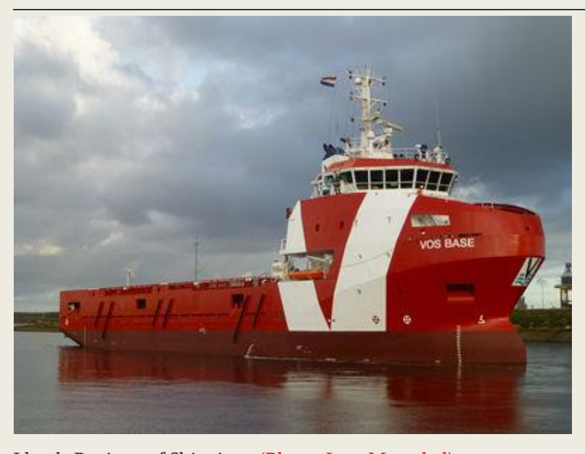
Lloyds Register of Shipping.

It is reported that's Vroon Offshore Supply Vessel Base Express (Imo 9378046) has been renamed VOS Base. The 2008 Damen Shipyard Galati OSV is renamed during her special drydocking at the Oranjewerf in Amsterdam. The Dutch registered vessel with call sign PBNJ and owned by Base Express BV – Den Helder; Netherlands and managed by Vroon Offshore Services BV -Den Helder: Netherlands has a grt of 2,534 tons and a dwt of 3,130 tons. She is classed by