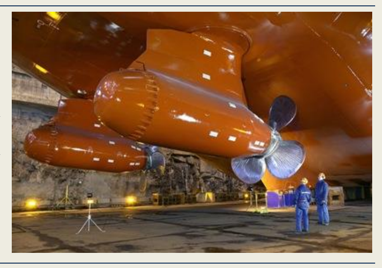
ABB. the leading power and automation technology group, has won an order worth around $25 million supply its marine propulsion system, Azipod, complete electric power plants for new rescue and salvage two icebreakers that under construction at Nordic Yards GmbH in Germany. The new vessels, owned by Russia's State Maritime Rescue Coordination Centre (SMRCC), will be used for patrols and rescue